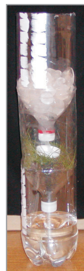
The water cycle in a bottle. You just need three pop bottles, some string, masking tape, potting soil, seeds and ice. Then just add water!