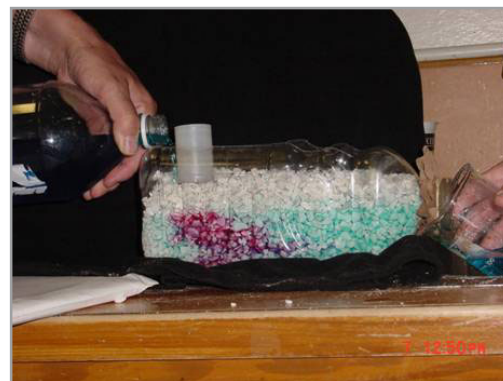
Model showing groundwater flow, including the flow of pollutants. A lot of cranberry juice was consumed in the development of this activity!