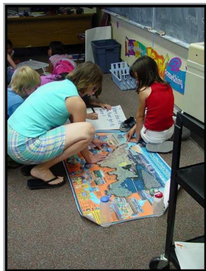
A teacher trying out the draft poster and activities in her classroom before the poster was final.

The images from the poster are available for download from the usual geoscape site: www.geoscpae.nrcan.gc.ca . The two curriculum guides are available for download from the City of Calgary web site: www.calgary.ca/waterservices - click on Youth Education in the left-hand menu and then on Teacher Guides to the Bow River Basin. Please feel free to download whatever you want. Most of the activities can be adapted to any area of Canada with a little forethought.