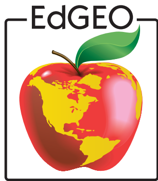
Canadian Earth Science Teacher Workshop Program